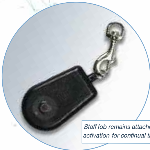
Staff fob remains attached after activation for continual tracking